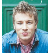
JAMIE OLIVER THE NAKED CHEF 2